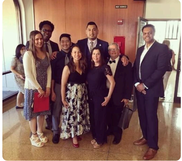
Skyline Graduation, Staff Group Picture