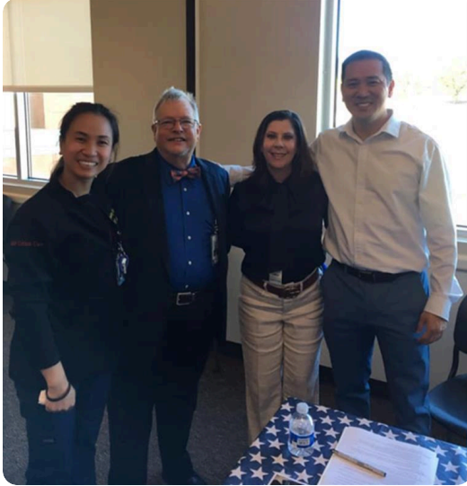
VA Colleagues at Skyline Career Fair